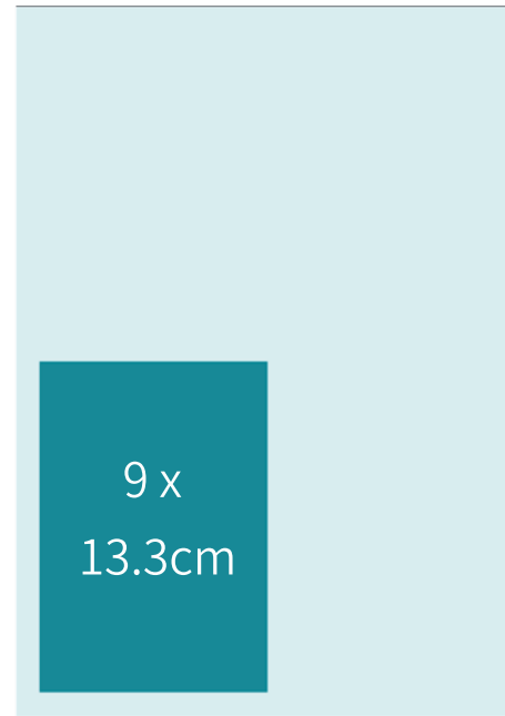
Quarter Page $400 +GST