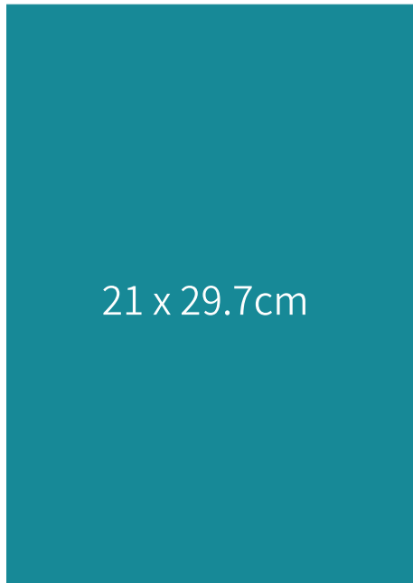
Full Page $1200 +GST